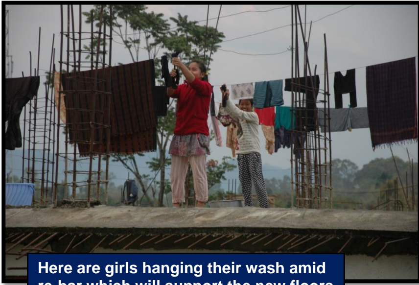
Here are girls hanging their wash amid re-bar which will support the new floors that will go up starting in July.

For several years the multi-purpose building has had rebar sticking up in the air symbolizing the vision that the James Connection planners have of its vertical expansion. At last, beginning in July, Angels' Place will build the final two floors. A large building will become larger. The first floor houses the girls' dormitory, the dining hall, the infirmary and the kitchen. Till now the roof has only served as a place for the girls to hang their wash to dry. Counselors have worried for the children's safety on a roof that has no guard rails. Not only that, but the roof is really a floor which will soon develop leaks if that